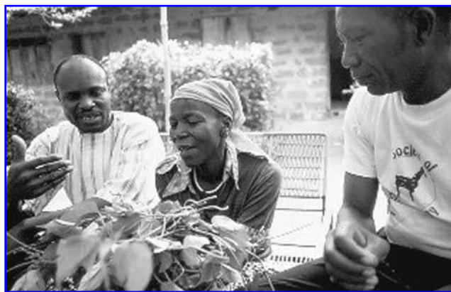
FIG. 2. Traditional healer with plant during interview.